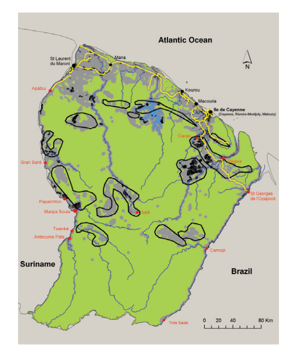
Fig. 1: geography of French Guiana. Only the main rivers are represented. The rainforest is in green. The areas facing anthropic impact are represented in gray (medium) and black (high) (de Thoisy at al. 2010). Gold wealth subsoil is circled in black. The entire road network is represented in yellow. All towns and villages located in a malaria endemic area and reporting malaria cases are represented in red. In these latter, cares are provided only by a health centre.

occurred along the Maroni and Oyapock rivers, representing 80% and 20% of the cases, respectively. Along the Maroni, the incidence of 360 cases per 1,000 inhabitants was almost exclusively linked to Plasmodium falciparum (Strobel et al. 1985, Esterre et al. 1990). Very few Plasmodium malariae cases were observed each year in this part of the region. This species was very similar to Plasmodium brasilianum, transmitted by monkeys in the wild. In fact, these two species may be one and the same in this region (Fandeur et al. 2000, Volney et al. 2002). Plasmodium vivax has always been rare along the Maroni, where the population is predominantly composed of Maroon people of African descent with a natural resistance to this parasite species; cases only occurred in some Amerindian communities in the upper part of the river. On the Oyapock side, the incidence in the 80s was about 485 cases per 1,000, of which 30% of cases were due to P. vivax (Juminer et al. 1981). Little transmission was observed in the coastal area (incidence 9.3 cases per 1,000 inhabitants).