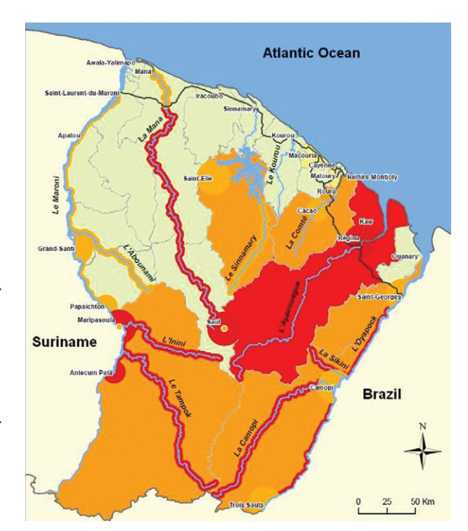
Fig. 3: risk of malaria in French Guiana between September 2012 and March 2013. This map represents the risk of malaria contamination at the municipality scale. This risk is calculated from the number of registered malaria cases, the presence of Anopheles vector and gold mining activities in the municipality. Municipalities with very low risk of malaria are represented in yellow. Orange represents low risk and red, the highest risk. Between April and August, the three municipalities on the east, namely St Georges de l'Oyapock, Camopi and Trois Sauts, are generally at low risk because of the seasonality of transmission.

Control strategy and current issues - Test, treat... -The test and treat strategy relies on a network of public and private professionals that enables patients to be diagnosed and treated close to their homes (Fig. 1). The private medical sector is composed of one hospital in Kourou and a number of general practitioners (n = 371), medical laboratories (n = 7) and pharmacies (n = 47). Drug distribution is well regulated and follows French Agency for Drug Safety directives. The public health sector is composed of hospitals in the two main towns of French Guiana - one in Saint Laurent du Maroni and